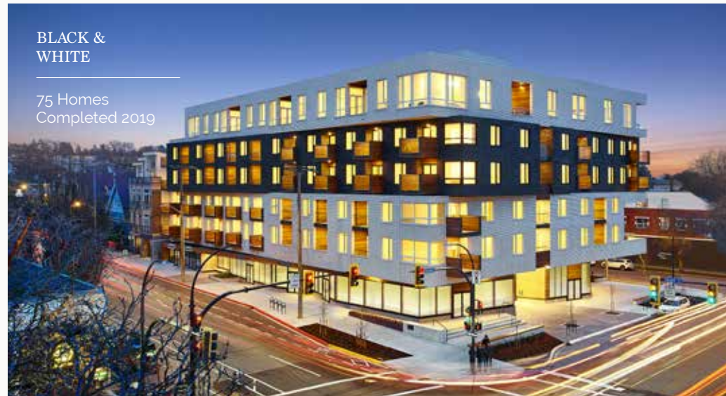
BLACK & WHITE